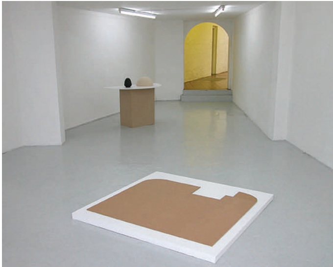
Finesse by Craig Leonard at the Acme Project Space. Photo: Craig Leonard (2012)